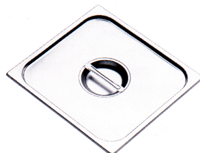
Tapa normal [TG19]